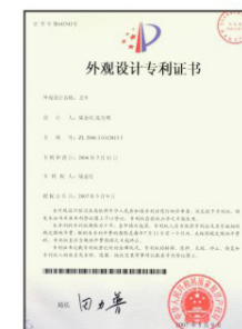
TOTALLY 17 PATENTS